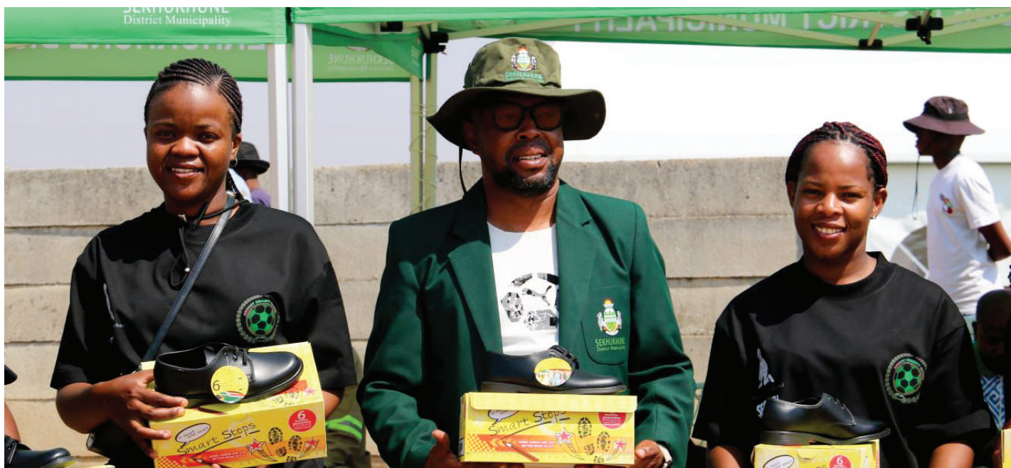
School shoes were among items donated to destitute children during the 11th Annual Moutse August Charity Games organised on Saturday 31 August 2025 at Dikwena Sports Ground in Dennilton, Moshate wa Ntwane.

NTWANE - The 11th Edition of the Annual Moutse August Charity Games were held on Saturday 31 August 2025 at Dikwena Sports Ground in Dennilton, Moshate wa Ntwane, bringing together communities in the Sekhukhune District Municipality (SDM).