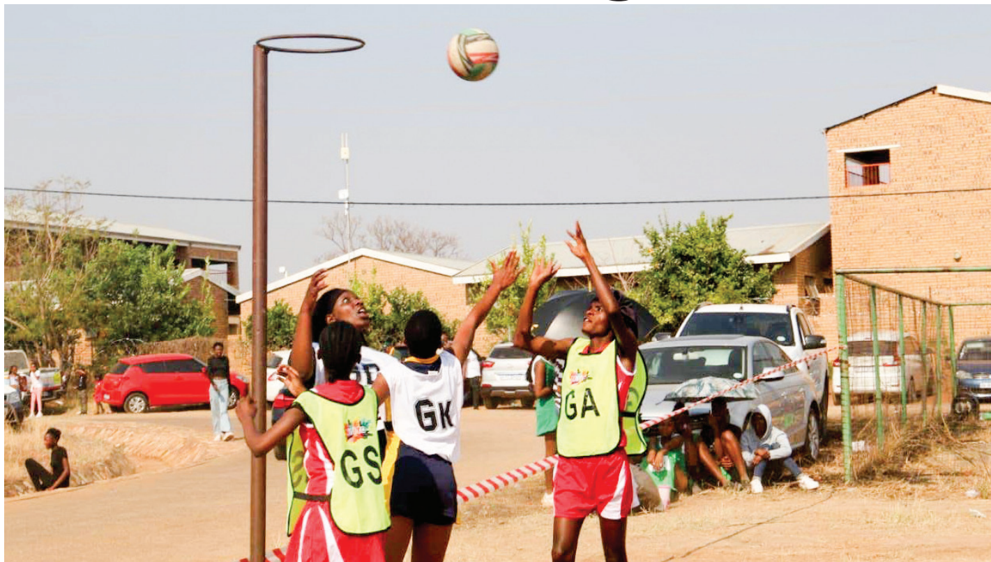
Ladies participating in netball