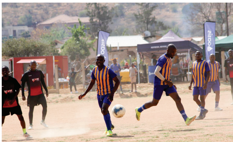
Football clubs battling-it-out during a soccer match at the Annual Moutse August Charity Games, held at Dikwena Sports Ground in Dennilton, Moshate wa Ntwane.

EMLM Mayor highlights key priorities during Lekgotla