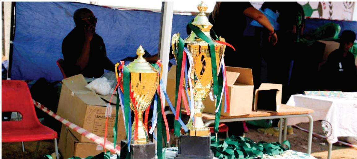
Trophies and medals seen at Dikwena Sports Ground