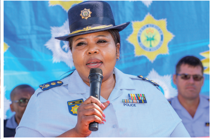
Provincial Commissioner of the Police in Limpopo, Lieutenant General Thembi Hadebe, says the newly appointed Constables should play a critical role in ensuring that residents, holidaymakers, and businesses in the province are feeling safe.

POLOKWANE - The South African Police Service (SAPS) in Limpopo has deployed 132 newly recruited and trained Police Constables to various districts across the province to strengthen crime prevention efforts, particularly during the upcoming festive season.