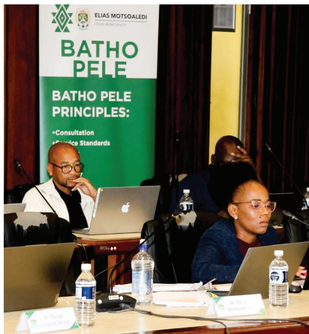
EMLM employees sharing ideas during the Mayoral Annual Lekgotla held at the Municipal Chambers in Groblersdal.

According to the LPWRI, the newly appointed officials are expected to play a crucial role in driving the department's service delivery mandate and contributing to the development of Limpopo's infrastructure.