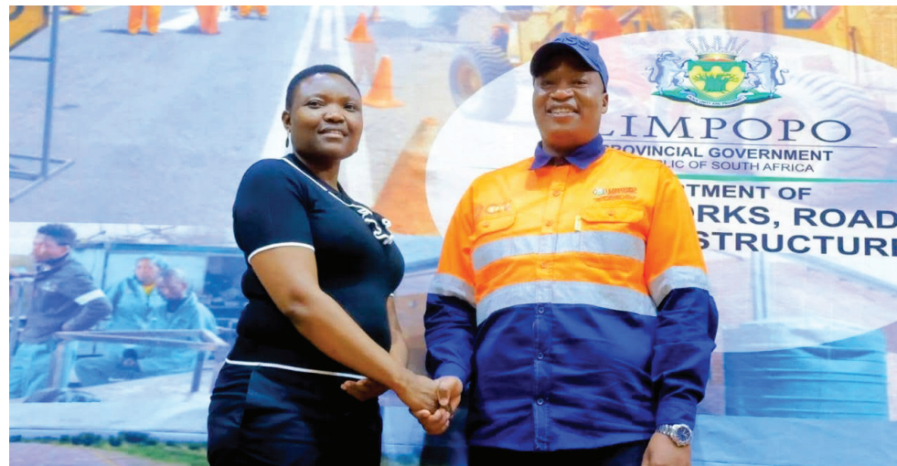
MEC for LPWRI, Ernest Rachoene (Right) has welcomed new officials to strengthen the department's capacity and improve service delivery in the province.