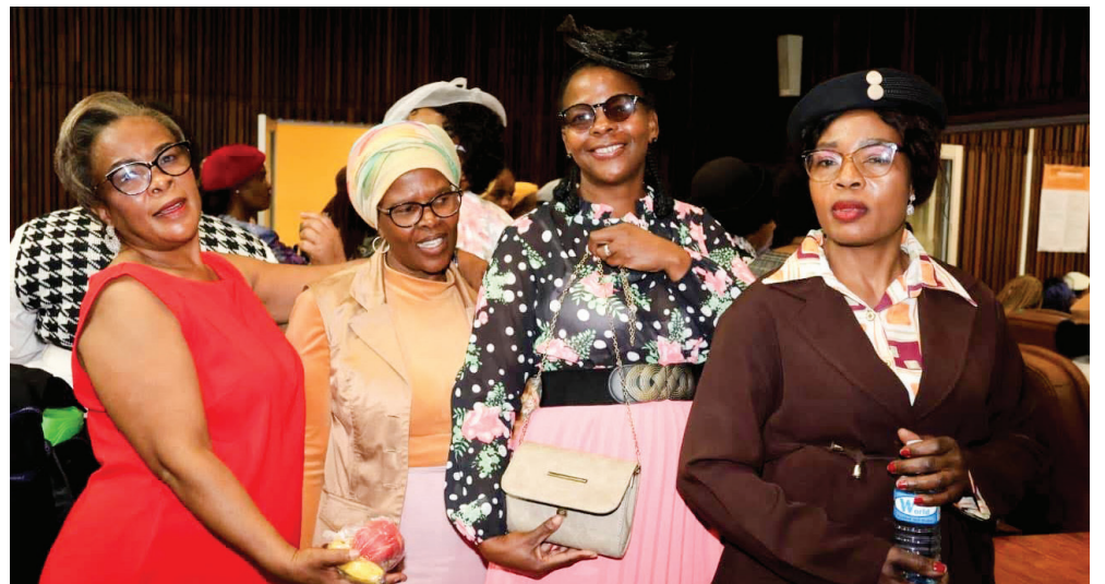
EMLM female employees mesmerised in the Council Chamber rocking vintage outfits to wrap-up the Women's Month.

"To build a truly African City that is citizen centred and driven"