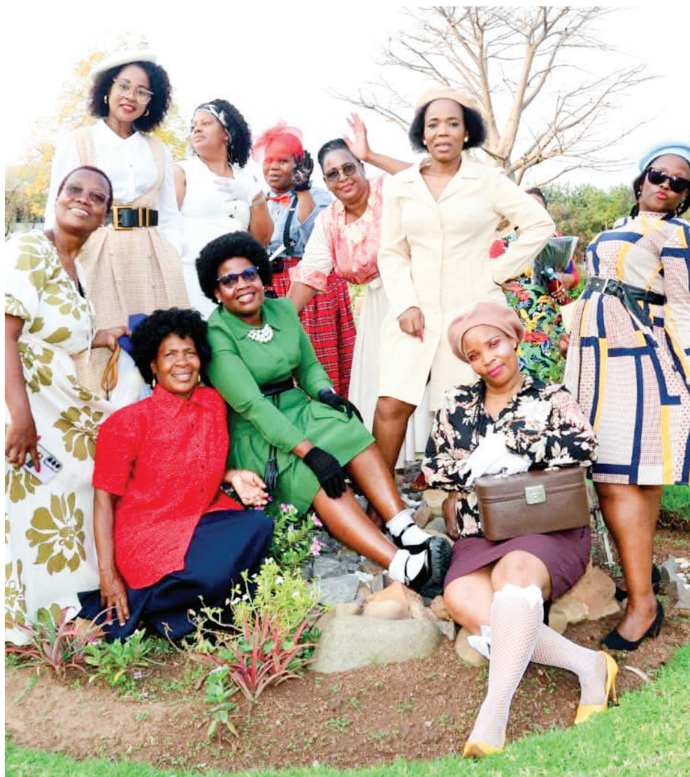
EMLM female staff members commemorate Women's Month with Vintage Outfit Celebrations.