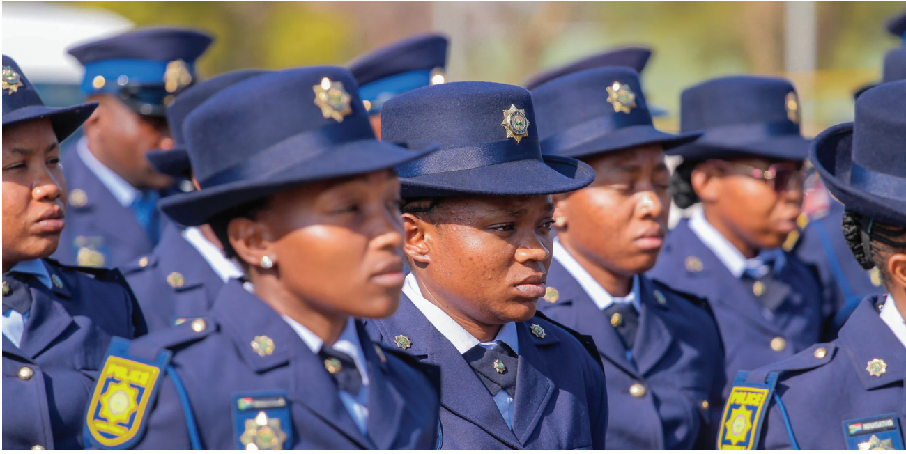
The newly deployed 132 Police Constables are set to strengthen crime prevention efforts, particularly during the upcoming festive season across Limpopo Province.